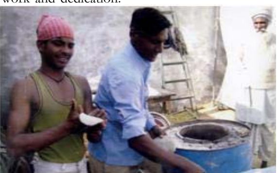
Tandoori Roti Ready!

He had constructed a small Tandoor oven with clay in his house for regular practice during the training period. After completing the training he started working as Tandoor operator in a hotel during night shift and worked as a caterer during the day. He earned Rs. 75/- per night at the hotel during the initial days and Rs.150-200 later. Gradually his earning reached Rs. 4000 to 6000/per month. Conquering the initial hurdles, his enterprising skill helped him to excel further in catering business. He emerged as one of the best and skilled Tandoor operators in the region. He started undertaking catering service during family/ social functions. For this he appointed two employees to assist him in this work. Now, he is earning a handsome amount of Rs. 10,000 to 15,000/- per month and takes care of his family. Indeed he has become a role model for his hard work and dedication.