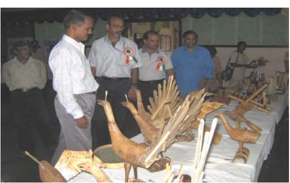
Jamshedpur Market Fair